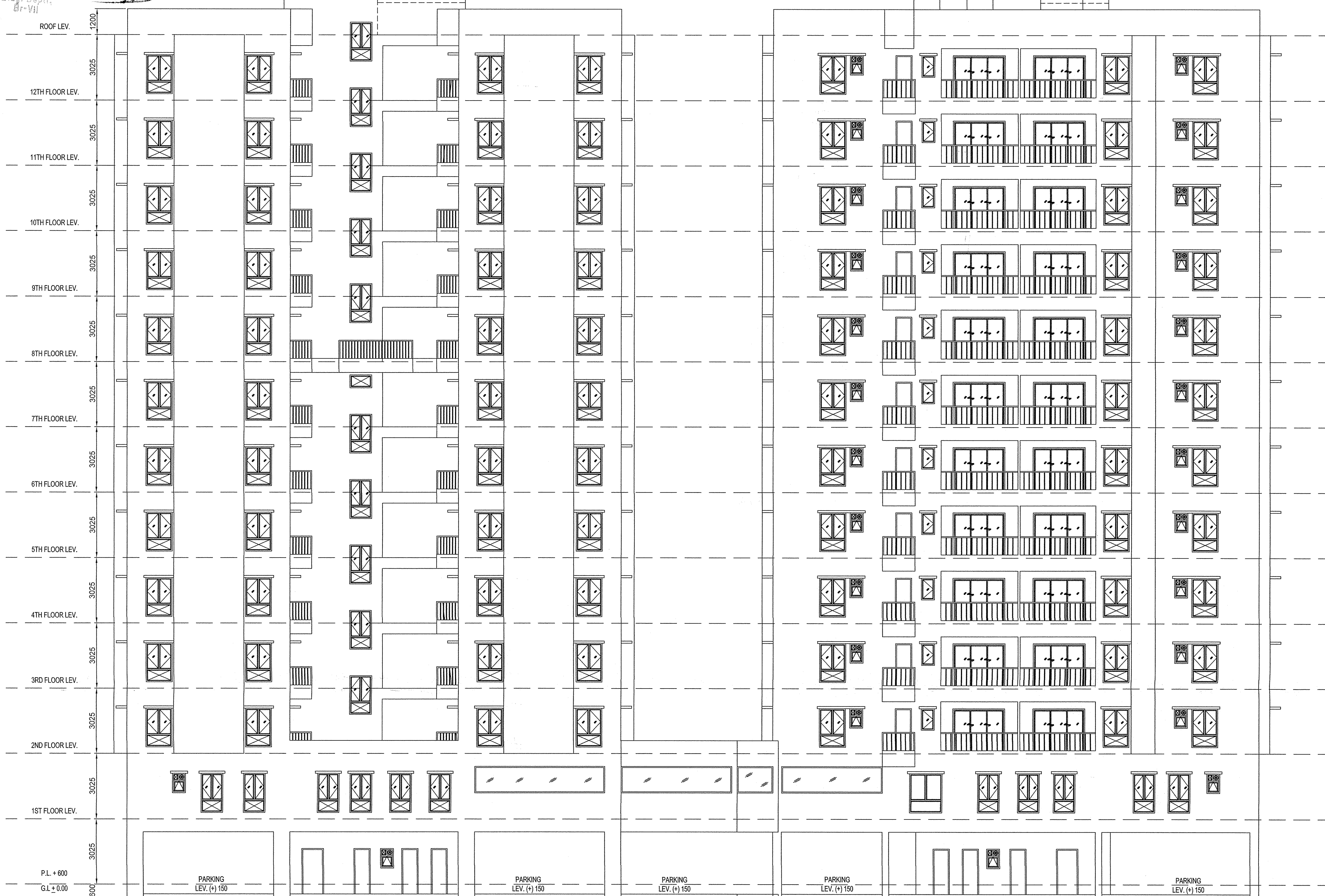
ROAD SIDE ELEVATION